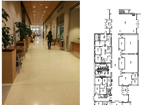
Fig. 1. The hallway in which the human field study took place.

This study was performed in a hallway at UT Austin which becomes crowded during class changes (see Figure 1). Two of the authors trained each other to proficiently look counter to the direction in which they walk. They acted as confederates who interacted with study participants. Both of the confederates who participated in this study are female. A third author acted as a passive observer (and recorder) of interactions between these confederates and other pedestrians.