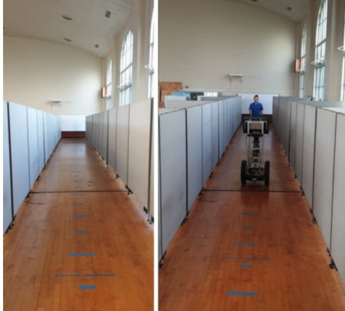
Fig. 2. The hallway constructed for this experiment (left) and a snapshot of the experiment during execution (right).

head. The head turn takes 1.5 seconds. These timings and angles were hand-tuned and pilot tested on members of the laboratory. The gaze signal can be seen in Figure 4 (left).