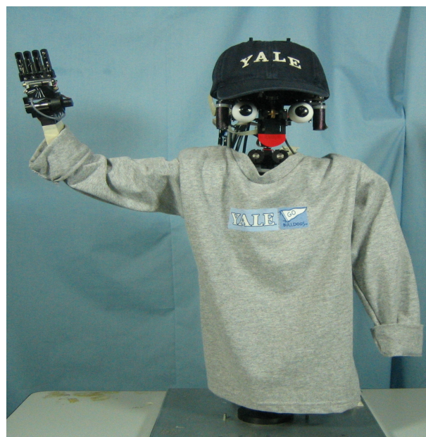
Fig. 2. The upper-torso robot Nico inside the laboratory setup.

3) The Robot Nico : The robot used throughout this experiment was an anthropomorphic upper-torso robot designed with the proportions of a one-year old child, named Nico [14]. Although Nico's construction is not concealed, Nico has a friendly, non-threatening face. The robot wore a (child's) sweatshirt and baseball cap during the interactions (see Fig. 2). Nico's head has a total of seven degrees of